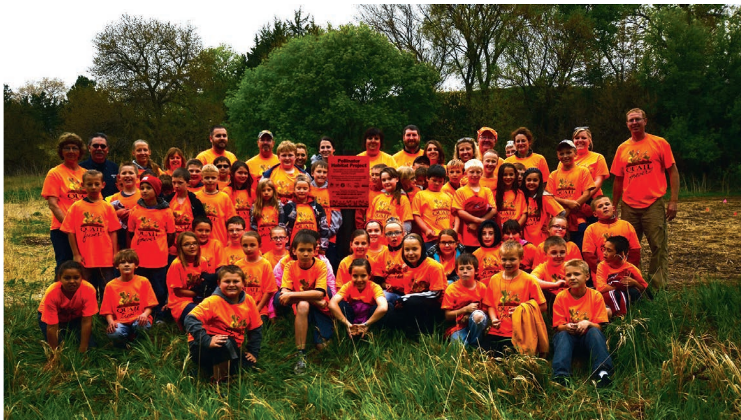
Pheasants Forever and Quail Forever T-Shirts are a great addition to your project and they look great for photos!

If you purchase t-shirts for participants, try to get them to the students prior to the actual event. Having all the kids in a PF/QF shirt will make great newspaper photos and you will find that students will wear their free shirt throughout the year providing additional promotion for your local chapter. You can purchase youth PF/QF shirts through the PF/QF Market Place.