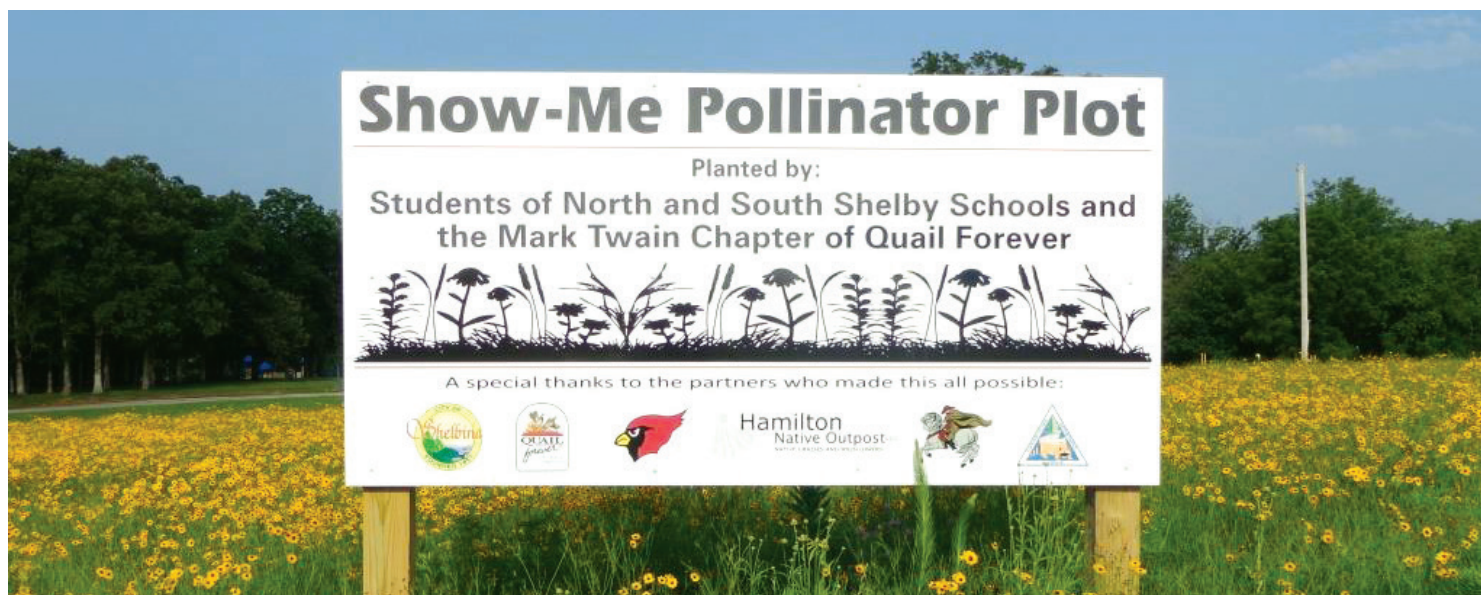
This successful pollinator project was planted by 3rd graders in Shelby, MO.

Curriculum is available to chapters that are working with schools and classrooms to establish, maintain, and monitor pollinator habitat projects. The curriculum is free of cost and can easily be downloaded and emailed to the teacher you are working with on your project. You can download various types of pollinator curriculum on our blog at www.pfqfhabitated.blogspot.com .